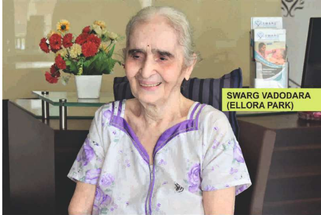
SWARG VADODARA (ELLORA PARK)